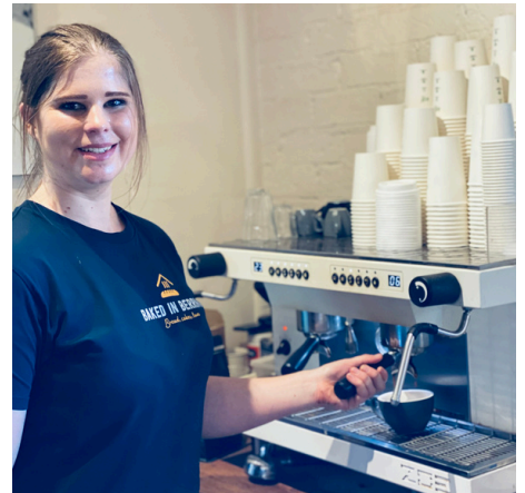
Baked in Berrima Open Thurs - Sun