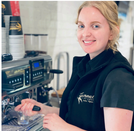
Gumnut Patisserie Open 6 days Closed Tuesday