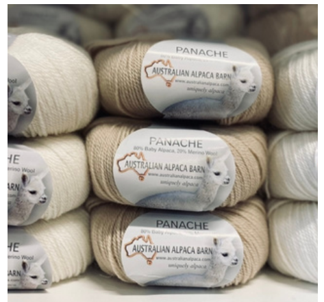
Australian Alpaca Centre The Market Place Open 10.00am - 4.00pm 7 days