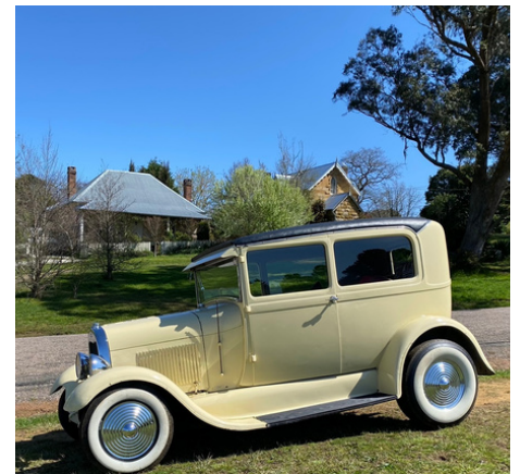
Cars & Coffee Meet Sunday 8.00am - 10.00am 30th June, 28th July, 25th August