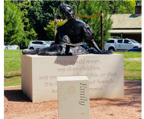
Charlotte Waring Atkinson statue. Australia's first children's book author, Marketplace Park