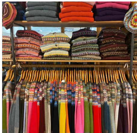
Berrima's Overflow Open 10.00am - 5.00pm 7 days