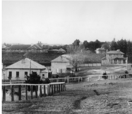
Berrima Walking Tours Tours every Fri, Sat & Sun 10.00am