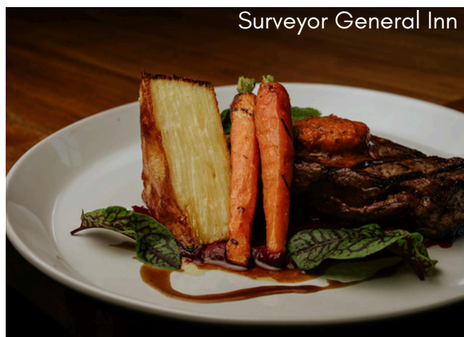
Surveyor General Inn