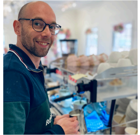
The Cupcake Co Open 6 days Closed Tuesday