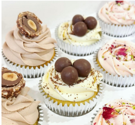
The Cupcake Co Open 10.00am - 4.00pm 6 days, closed Tuesday