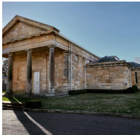
Berrima Courthouse Open 7 days 10.00am - 4.00pm