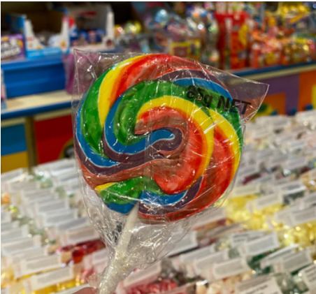
Lolly Swagman Open 10.00am - 4.00pm 7 days