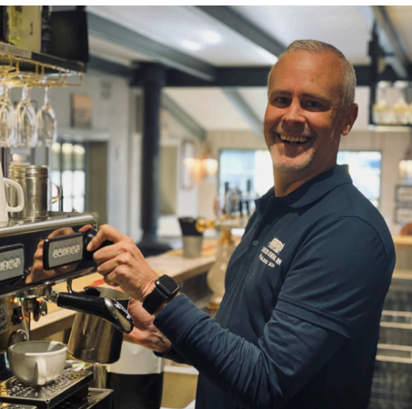
Surveyor General Inn Open 7 days