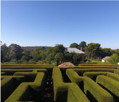
Harpers Mansion Maze Open Sat & Sun 11.00am - 3.00pm