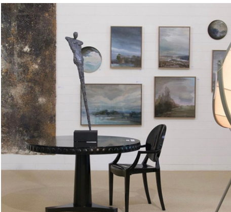
Whitewall Art Projects Jellore Street Berrima Open 10.00am - 4.00pm Friday - Monday