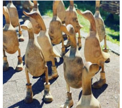
The Brown Shutter Open 10.00am - 5.00pm 7 days