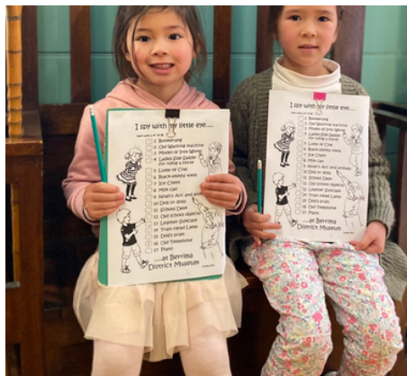
Berrima District Museum Ask for the cute find and seek colouring page for the kids. Fun & a history lesson all in one. Open Fri - Sun. 10.00am - 4.00pm