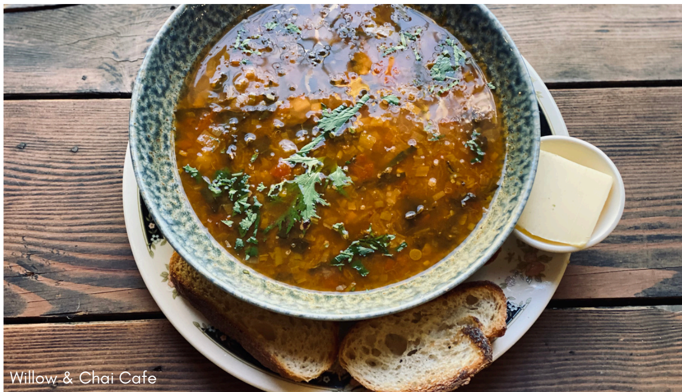
Willow & Chai Cafe