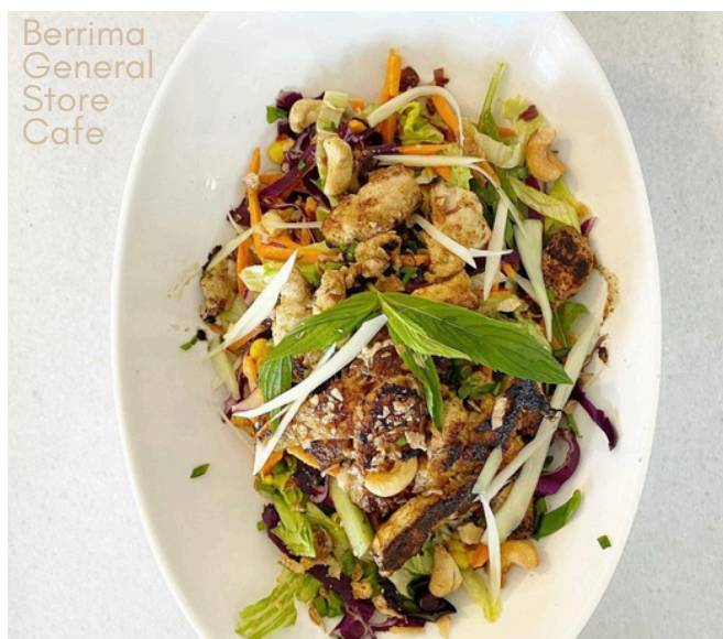
Berrima General Store Cafe