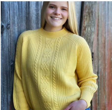
Berrima's Natural Australia Open 10.00am - 5.00pm 7 days