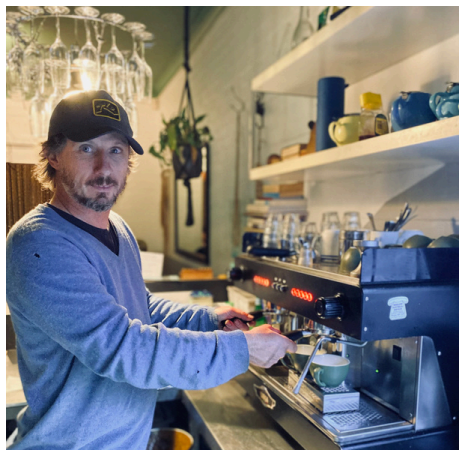
Josh's Cafe Open Wed - Sun