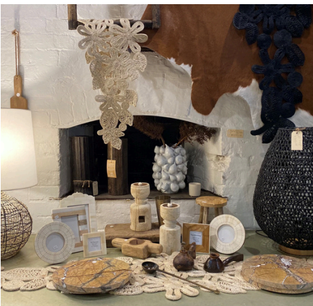
Berrima Village Pottery & Home Open 10.00am - 4.00pm Open 6 days. Check Instagram for open days