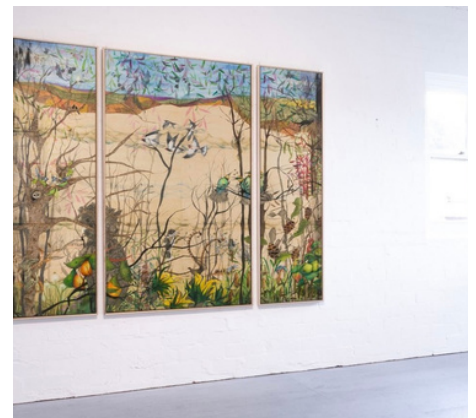
Michael Reid Gallery Old Hume Highway Berrima Open 10.00am - 5.00pm Open 7 days