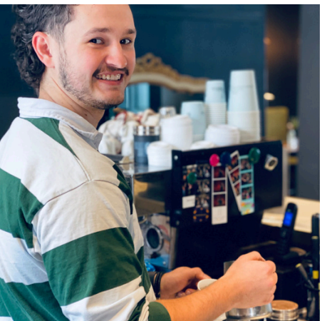
Berrima Vault House Open 7 days