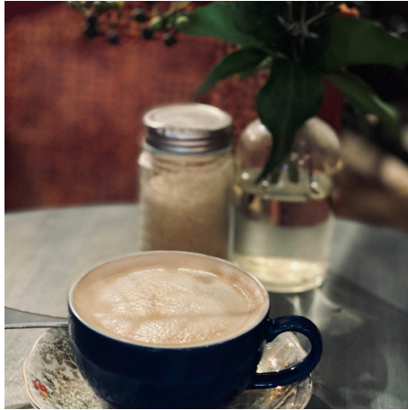
Willow & Chai Cafe Open 7 days