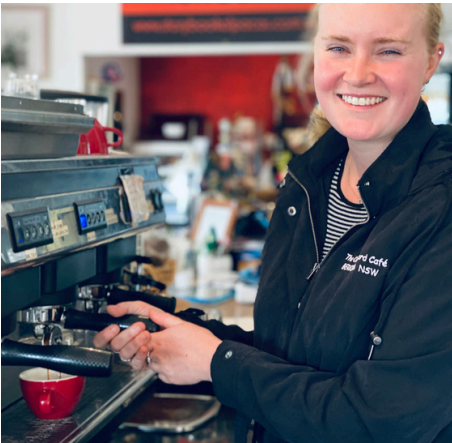
The Courtyard Cafe Open 7 days