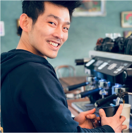
Berrima General Store Cafe Open 7 days