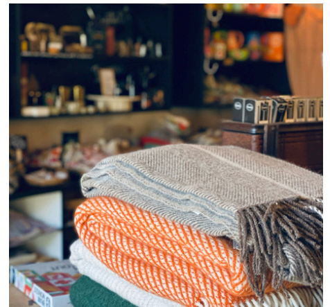
Willow & Chai Cafe Open Sat - Wed. 8.30am - 5.00pm Thurs - Fri. 9.00am - 5.00pm 7 days